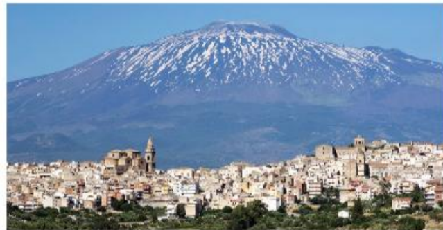
Farewell To Sicily

The tour officially ends after breakfast this morning. We will organize small group transfers to the airport by public taxis (not included). If you wish to extend your stay in Taormina, please let us know on your reservation form so that we can keep your room available for another night. (Breakfast) .