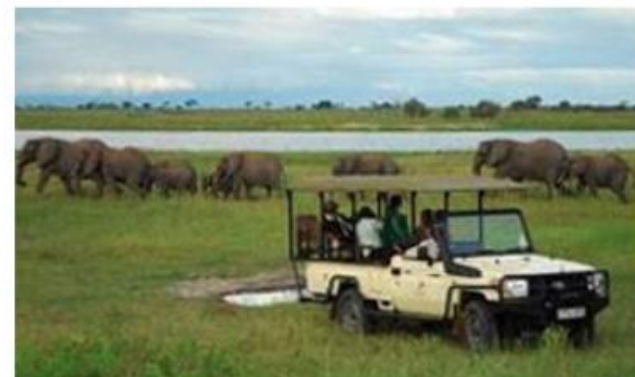
Farewell to Botswana

Enjoy a last wildlife run this morning and a hearty breakfast before flying back to Maun, where we connect to a flight back to Johannesburg. Most international flights departing South Africa leave sometime in the evening. You will arrive back home sometime tomorrow. (Breakfast & Meals Aloft)