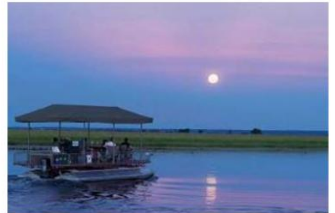
Okavango Boat Trip at Sunset

Your activities at Camp Okavango for your two days here will center around mokoro (dugout canoe) rides, boat excursions and walking safaris. See the delta from water level and relax as you glide through quiet reed-lined channels. Birding is excellent, with more than 600 species residing within the 7,000 square miles of islands, marshes, flood plains, and channels of which the Okavango is comprised. Enjoy a walking safari and take a boat through the reeds to spot some of the larger species such as elephant, red lechwe, zebra, wildebeest, giraffe, baboon, monkey, warthog, and buffalo, along with major predators such as lion, leopard, and hyena. If you are lucky, spot the elusive sitatunga antelope which have been known to sleep in the water, with only their nostrils resting above the water's surface. (All Meals)