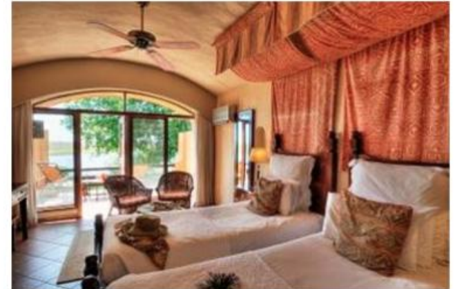
Chobe Game Camp

A major feature of Chobe National Park is its overabundance of elephants, often seen at the riverfront bathing in the water. Vast numbers of elephants come down to drink in the late afternoons and it is possible to see as many as 1,000 of these magnificent animals in a two-hour wildlife drive. Botswana's elephant population is currently estimated at around 120,000, which has built up steadily from a few thousand in the early 1900s and has escaped the massive illegal decimation of other populations in the 1970s and 1980s. The elephants in this area have the distinction of being the largest in body size of all living elephants, although the ivory is brittle so you will not see many huge tuskers among these gentle giants. (All Meals)