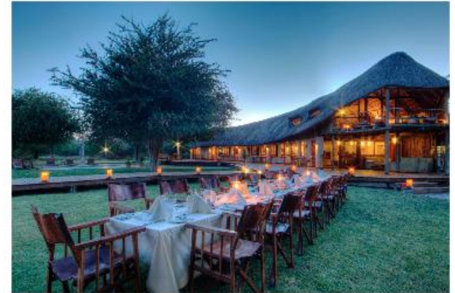
Leroo La Tau Lodge

Our lodge, Leroo La Tau, is built on the cliffs above the Boteti River which allows guests a raised vantage point resulting in spectacular wildlife sightings. The Boteti River which dried up for 28 years is now flowing again. This life line of water is a magnet for wildlife to congregate and herds of zebra and wildebeest migrate here for this precious resource. The river's return has transformed the region and supports a good volume of wildlife all year round with sightings of all the common antelopes, including healthy populations of kudu as well as giraffe. Huge elephant bulls are based along the river all year round and make for great sightings splashing in the river, and lion are very active in the region. The river draws thousands of zebras galloping up and down the dusty river banks for quite possibly one of the best zebra viewing experiences in Africa! (All Meals)