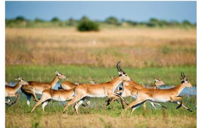
Lechwe in Okavango

Camp Okavango is situated on remote Nxaragha Island in the very heartland of the Okavango Delta. The camp comprises 12 two-bedded East African style tents featuring private sundecks and en-suite hot shower and waterborne toilets, and each tent is exquisitely furnished. Camp Okavango's unashamed luxury blends with the Africa of yore in the elegant thatch and lethaka main lodge buildings. Meals are silver service at dining tables romantically lit by candelabra. The dining-room leads onto an expansive open-air patio for evenings around a blazing camp fire. Other lodge facilities include a cocktail bar, lounge, wildlife reference library, a secluded bird-viewing hide, shaded hammocks, reading benches and a delightful sun-deck and plunge pool for relaxation during the hot midday hours. (All Meals)