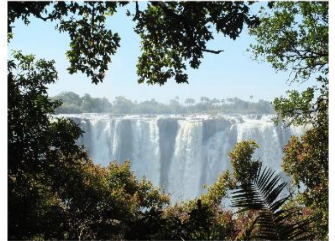
Farewell to Victoria Falls

You have one last chance to photograph the incredible falls this morning before we transfer to the airport for our late morning flight to Johannesburg. Here you will connect with your overnight international flight back home. (Breakfast & Meals Aloft)