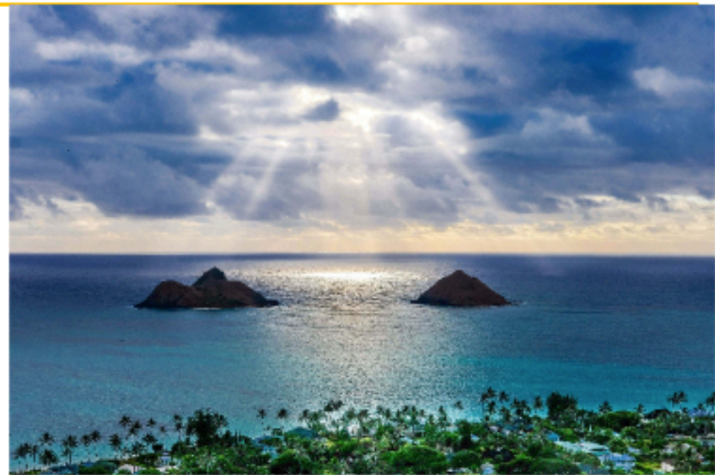
Fly to Flores

After breakfast this morning, we check out from our hotel in Ubud and make our way back to the airport for our late morning flight to Labuan Bajo on Flores Island. Our flight leaves around 11:00 am and arrives at 12:30 pm. Upon arrival in Labuan Bajo, a local guide will meet us at the airport. On the way to our resort we stop first at Batu Cermin, a beautiful limestone cavern with natural skylight shafts. We then visit a local market before finally arriving at our resort. Upon checking-in to our rooms, the afternoon and evening are free to enjoy the pool, walk along the beach or just enjoy the spectacular view of the coast, the ocean and the nearby islands. Overnight in Labuan Bajo. (Breakfast)