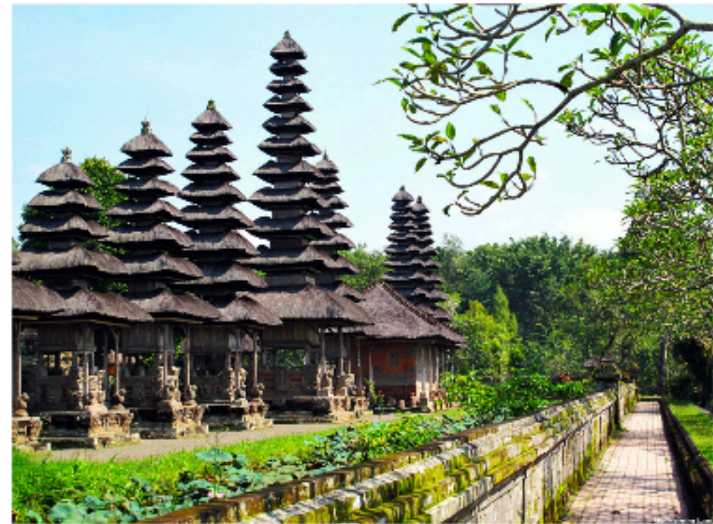
Taman Ayun Temple in Seminyak

This morning enjoy breakfast and some leisure time before checking out of our rooms and leaving the resort for the local airport. We take an early afternoon flight back to Bali, leaving around 1:00 pm and arriving by 2:30. Upon arrival at the Denpasar Airport, a guide meets us and accompanies us to our new resort in Seminyak just a short distance away. Our resort is located on Bali's most coveted western-facing beach, making it the perfect opportunity to watch those famed Seminyak sunsets over the ocean. The rest of the day is free. Overnight in Seminyak. (Breakfast)