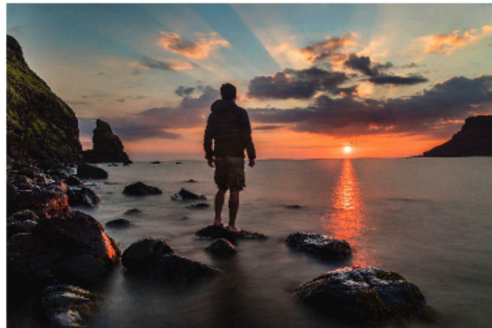
Free Day in Seminyak

Overnight in Seminyak. (Breakfast / Dinner)