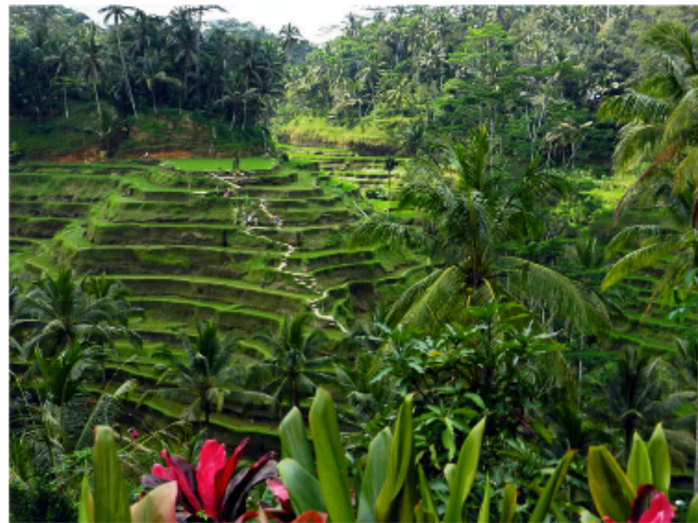
Ubud Rice Terraces