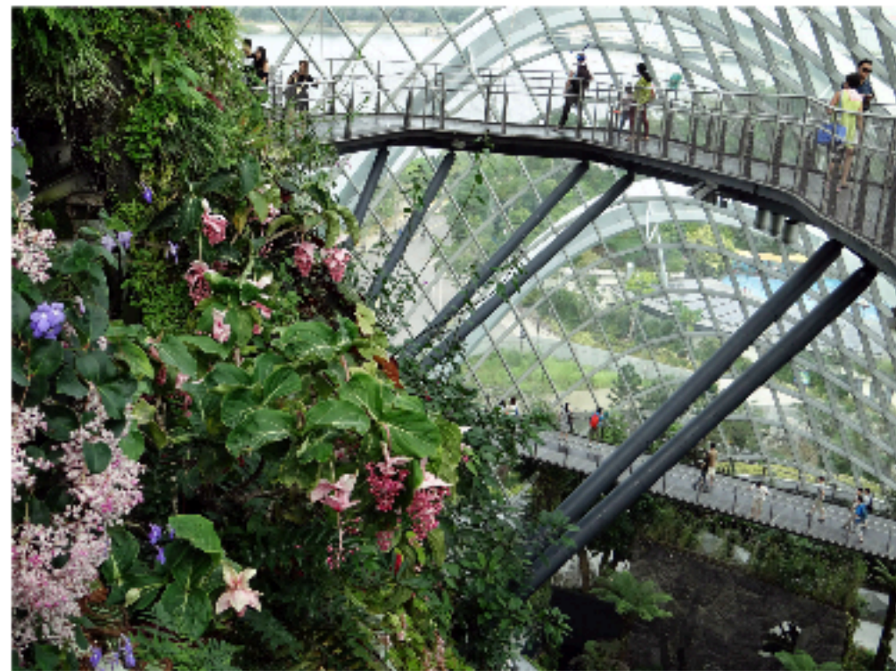
Singapore Garden by the Bay

We have another full day touring Singapore. In the morning, we visit Gardens by the Bay - Singapore's latest iconic attraction. Step into the two climate conservatories. Flower Dome is the world's largest glass greenhouse with an ever-changing display of flowers and plants from the Mediterranean and semi-arid regions. Cloud Forest is a mysterious world veiled in mist. Take in breath-taking mountain views surrounded by diverse vegetation and hidden floral gems. The Skypark Observation Deck is at the Marina Bay Sands Hotel, located 57 stories above the city, providing a panoramic view of the skyline, the port, Marina Bay, the Gardens by the Bay and across the Pacific Ocean inlet to Malaysia. At the historic Raffles Hotel, enjoy a glass of the world-famous Singapore Sling cocktail. The evening is free. Overnight in Singapore. (Breakfast / Lunch)