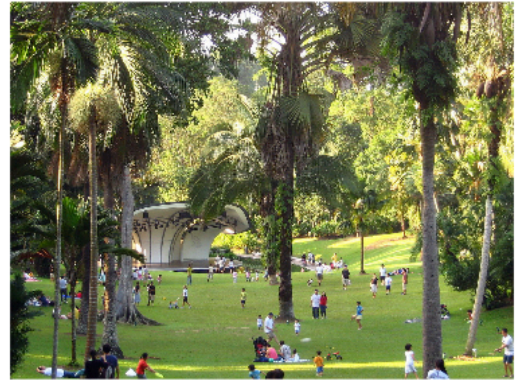
Singapore Botanic Gardens

Merlion Park is a popular spot for great views of Marina Bay and a picture-taking opportunity with the Merlion, a mythological creature that is part lion and part fish. We visit Little India in Old Singapore to see the lively trading community. Kampong Glam is a Malay enclave with a blend of history, culture and a super-trendy lifestyle. There is the famous Sultan Mosque built in 1928 with the massive golden domes and huge prayer hall. There is also the colorful Haji Lane with its quirky boutiques shops. Overnight in Singapore. (Breakfast / Lunch)