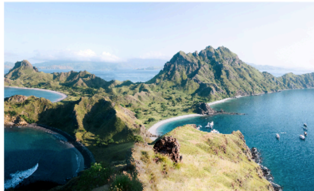
Padar Island Hiking

Today is entirely free to enjoy our resort and explore the many optional activities in the area. Our resort has its own private boat and can take you to nearby islands for adventures to suit any taste. You could choose to go trekking on the rugged hilly landscape of Padar Island. You could swim or float in the beautiful Rangko Cave. After a snorkeling or diving excursion, you might stop at Makassar Reef, a tiny sand bed island you can easily swim around. Take a dolphin-watching excursion or plan a sunset visit to Bat Island to watch thousands of indigenous bats head out on their nocturnal hunt for dinner. Overnight in Labuan Bajo. (Breakfast)