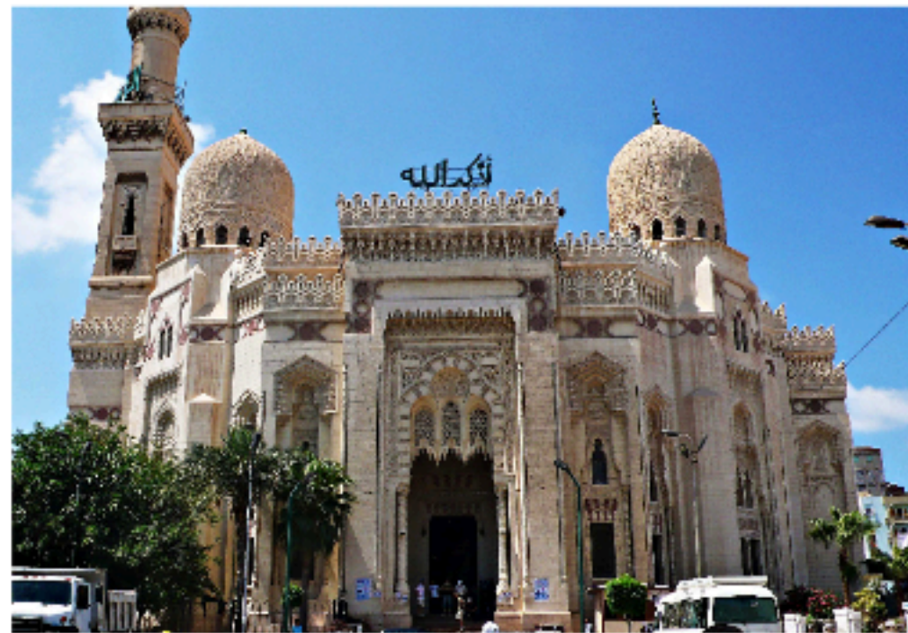
Abu al Abbas al Mursi Mosque

Enjoy a free morning to sleep in late, take a late breakfast, relax at the hotel or do some brief last-minute exploration close to our hotel. Lunch is on your own today. We depart our hotel in early afternoon and make the 2½-hour drive from Alexandria to Cairo. Once you have settled into our hotel for the start of the Main Tour, the remainder of the evening is at your leisure. Overnight in Cairo. (Breakfast)