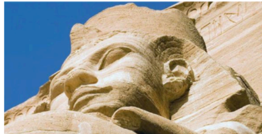
Farewell to Egypt

The tour officially ends after breakfast this morning. We provide your transfer to the international airport for your return flight home. If you wish to extend your stay in Cairo (or take the optional extension to Jordan), please let us know on your reservation form. (Breakfast)