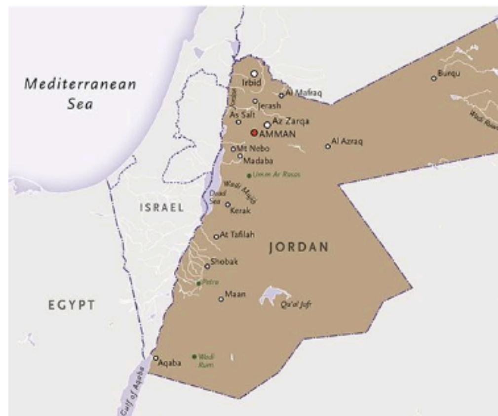
Jordan Map - Click to Enlarge

If you have come this far to see some of the most amazing sights in the world, why not extend your journey for a few more days to include the wonders of Jordan? The highlights of this extension include a float in the Dead Sea, ascending Mount Nebo, historic Madaba, incredible Petra by candlelight and daylight, the moon-like landscape of Wadi Rum, and a final night in Amman. A perfect enhancement to your Egypt adventure!