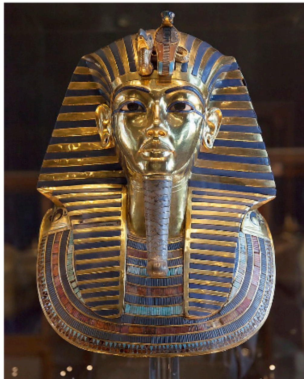
Grand Egyptian Museum

The Grand Egyptian Museum (GEM) Complex is brand new – opening in 2020! It is described as the largest archeological museum in the world displaying the heritage of a single civilization, exhibiting the full Tutankhamun collection with many pieces to be displayed for the first time. The museum is sited on 120 acres of land approximately two kilometers from the Giza pyramids and is part of a new master plan for the plateau. The Museum contains over 100,000 artifacts, reflecting Egypt's past from prehistory until the Greek and Roman Periods. As you enter the museum, you can't miss the colossal statue of King Ramses II, nor the 87 huge royal artefacts exhibited at the grand stairs. These stairs lead up to an impressive 28-meter-high glass façade overlooking the pyramids of Giza. The GEM also hosts over 5,000 artefacts from the tomb of the golden Pharaoh Tutankhamun. We will have lunch today at a restaurant inside the Marriott Mena Hotel, with views of the Pyramids. Returning to our hotel, the remainder of the day is at leisure. (Breakfast / Lunch)