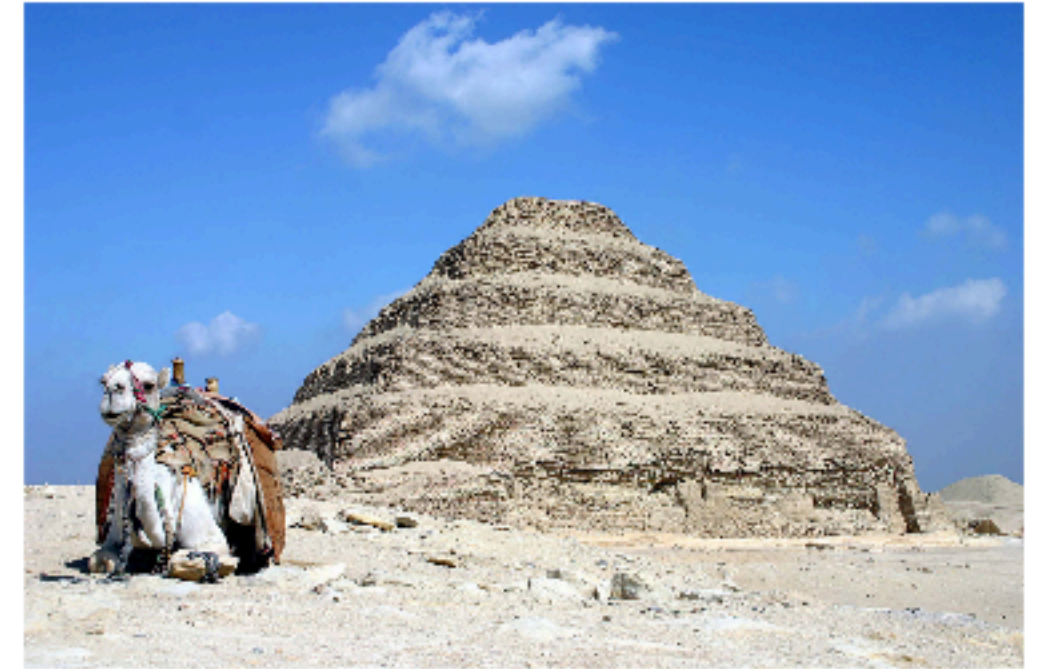
Sakkara Step Pyramid

The Great Pyramids of Giza are the only present-day survivors of the Seven Wonders of the Ancient World, built over 4,500 years ago as giant tombs for the pharaohs Khufu, Khafre and Menkaure, who were a father, son and grandson. The pyramids are truly monumental in scale, with the largest, Khufu's, constructed from over two million enormous stone blocks. We visit the Solar Boat Museum as well as the enigmatic Sphinx with the body of a lion and the face of a man wearing a royal head cloth, which workers may have based on King Khafre to guard his enormous funerary monument. We return to the hotel after a thrilling day, and the evening is at your leisure. (Breakfast / Lunch)