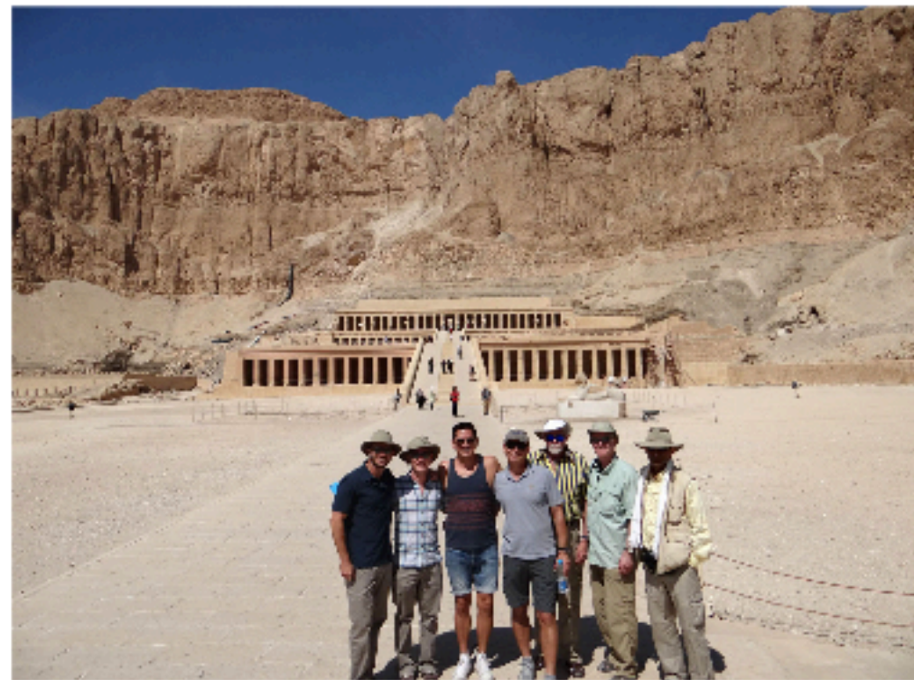
Funerary Temple of Queen Hatshepsut