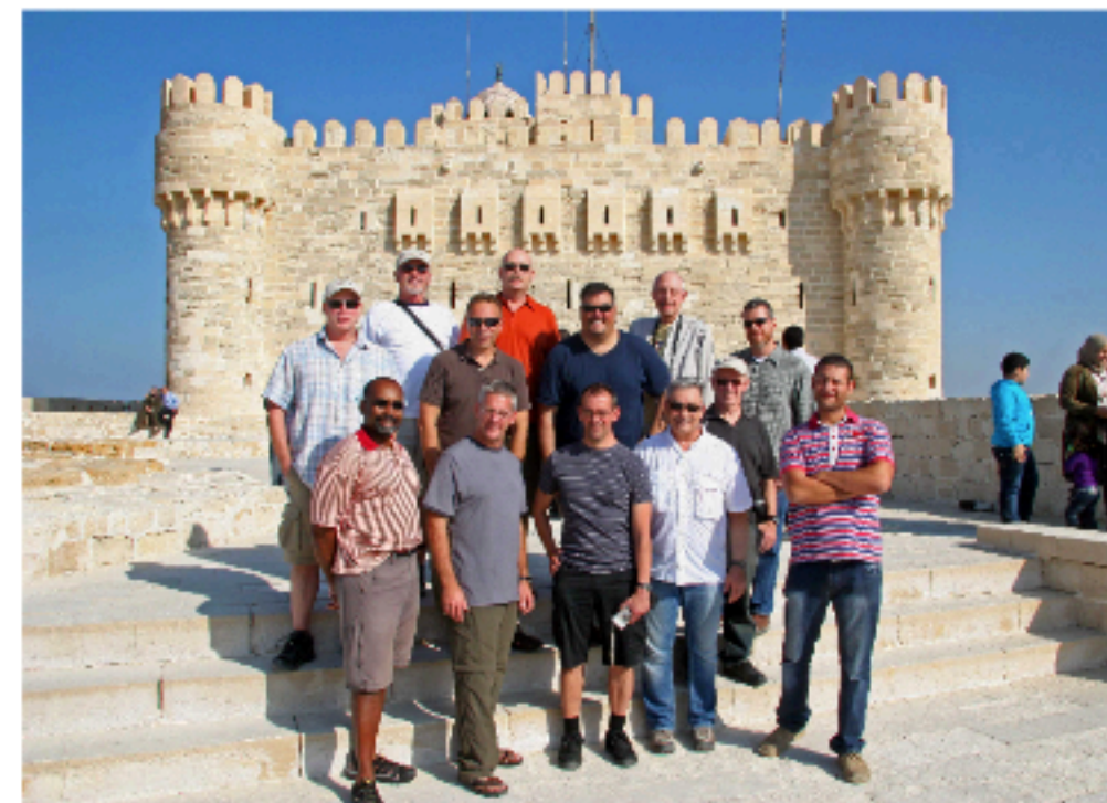
Qait Bay Fort