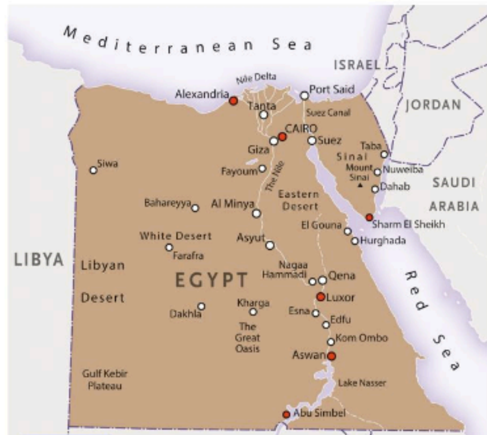
Egypt Tour Map - Click to Enlarge

If not participating in the optional pre-tour extension to Alexandria, plan to arrive in Cairo by mid-day today. We can arrange an additional night in Cairo if you wish to come early – simply let us know on your reservation form. Upon arrival at the airport, a local host will meet you and transfer you to our hotel in downtown Cairo. The afternoon is free to rest up from jet lag and enjoy the amenities of our luxury hotel. This evening our entire group will meet for the first time as Toto Tours hosts a Welcome Dinner at our hotel. Overnight in Cairo. (Dinner included)