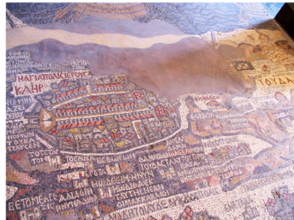
Madaba Mosaic Map

After a lunch stop, we arrive in Petra late afternoon and check-in to our hotel. We enjoy dinner tonight at a restaurant voted best in Jordan by the Grumpy Gourmet Magazine. After dinner you have the option to join our guide for the "Petra By Night" walk (not included). Experience the magical atmosphere of a candlelight visit to the rose-red city. The special aura of the ancient Nabatean trading empire comes to life as you enjoy a stroll through the mysterious Siq of Petra. At Al- Khazneh (The Treasury), listen to music and stories and experience Petra just as the travel-weary traders of old must have known it. This optional excursion departs from the Petra Visitors Center at 8:30pm, returning at around 10:30pm. Overnight in Petra. (All Meals)