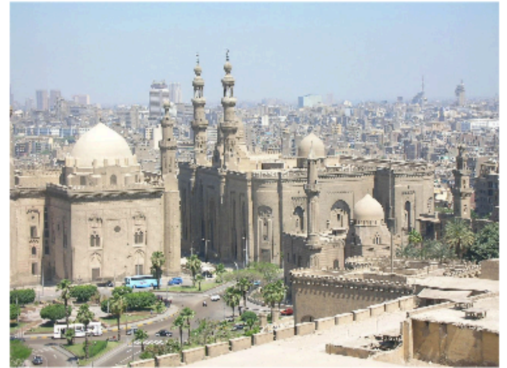
Cairo Historic Center

Lunch today is at a famous restaurant in the heart of the Khan El-Khalili Bazaar. After a wonderful meal, we enjoy wandering through the labyrinth of narrow streets in the Bazaar to marvel at the dazzling array of handicrafts for sale. Perhaps you will find some treasured souvenirs? We enjoy one more night in Cairo, and celebrate the Thanksgiving Holiday with a festive dinner at our hotel. (Breakfast / Lunch / Dinner)