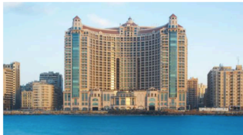
Four Seasons Hotel in Alexandria

Arrange for your international flights to arrive in Cairo, Egypt by mid-day today. Upon arrival at Cairo International Airport, a Tour Coordinator will be waiting to escort you by air-conditioned vehicle from Cairo to Alexandria. Our hotel is located on the waterfront, overlooking the Mediterranean Sea, providing a great base of operations to explore ancient Alexandria. Once you have checked into your room, the rest of the day is free to relax, unwind, and enjoy the amenities of our hotel. Dinner is included tonight at our luxury hotel on the Mediterranean Sea. (Lunch and Dinner included)