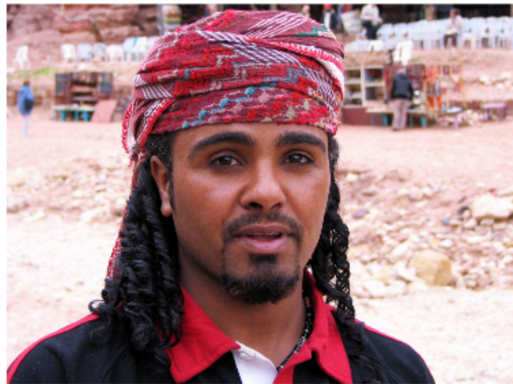
Farewell to Jordan

The tour extension ends officially after breakfast. We check out from our hotel, and board a vehicle for the transfer to Queen Alia International Airport and your flight home. Please let us know if you would like to extend your stay in Amman. (Breakfast)