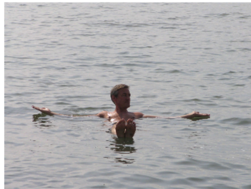
Floating in the Dead Sea

At 1,200 feet below sea level, the Dead Sea has drawn people to its shores in search of curative secrets. Due to high daily temperatures, low humidity and high atmospheric pressure, the air is extremely rich and the high content of oxygen and magnesium make breathing a lot easier. With the highest content of minerals and salts in the world, the Dead Sea water possesses anti-inflammatory properties, and the dark mud found on the shores have been used for over 2000 years for therapeutic purposes. Enjoy free time this afternoon to float in the water and take a mud bath on the shore. Dinner tonight is at an Italian restaurant located beside the infinity pool at our luxury seaside hotel. (All Meals)