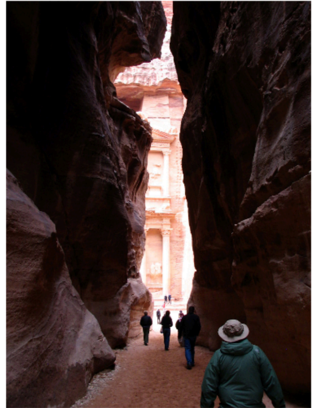
Entrance to Petra

This morning, we meet our guide at the hotel's lobby and walk with him to the Petra Visitors' Center to begin our visit to the archaeological site. Take a short horse ride from the main gate of Petra to the entrance of the old city, and then continue on foot through the winding canyon to the dramatic entrance. The ancient city of Petra was built between 800 BC to AD 100 by Nabatean Arabs. During this era Petra was a fortress, carved out of the jagged rocks in an area which was virtually inaccessible. When shipping slowly displaced caravan routes, the city's importance gradually dwindled and fell into decline. Nowadays Petra has become a popular tourist attraction, since being featured prominently in Indiana Jones and the Last Crusade (1984). During our tour we stop for lunch at the Basin Restaurant inside the Petra site. Enjoy free time to explore on your own and take amazing photographs before returning to our hotel. The afternoon is free. This evening we have dinner at Nabatean Cave Bar, located inside a Nabataean tomb in the hillside. (All Meals)