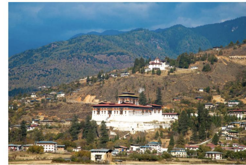
Paro Ta Dzong Watchtower and Rinpung Dzong

Visit the 17th century Ta Dzong. It was used as a defense structure to protect the region from invasions. Today, it is open to the public as the National Museum of Bhutan, showcasing a range of artifacts and exhibits related to Bhutanese culture and history. Next, head to the Rinpung Dzong meaning “fortress of the heap of jewels”. It has a long and fascinating history. Along the wooden galleries lining the courtyard of the Rinpung Dzong are fine wall paintings illustrating Buddhist lore. We walk downhill to the road, crossing a wooden bridge where during a previous Toto Tour we encountered the King of Bhutan. This evening Toto Tours hosts a Welcome Drink and Dinner at our hotel. Overnight in Paro. (Lunch / Welcome Dinner)