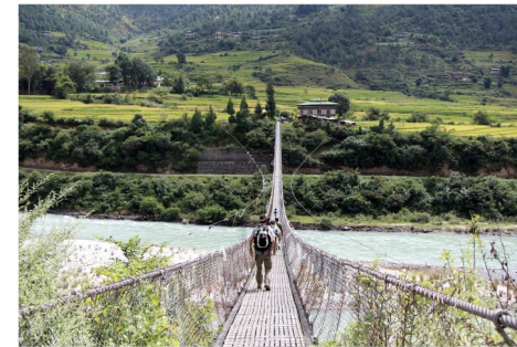
Punakha Suspension Bridge