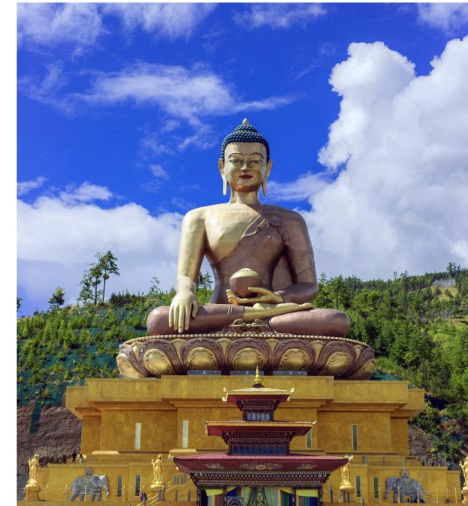
Bronze Buddha Statue at Kuenselphodrang

After lunch we drive to Paro. This one-hour drive takes us through the villages of Babesa, Namseling, Khasadrupchu and Wangsisina. We encounter Chuzom, the confluence of Pachu and Thimchu Rivers. The confluence is marked by three stupas, and it is also a tri-junction of roads leading to Thimphu, Paro and Haa. From the confluence we follow the Pachu River until we reach Paro. Check into the hotel on arrival. The evening is free to explore the town at our leisure. Overnight in Paro. (All Meals)