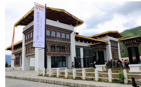
Royal Textile Academy