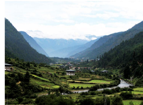
The Beautiful Haa Valley

Today we drive to the Haa Valley via Chele la Pass at about 13,000 feet elevation - one of the highest motorable passes in the country. It is beautifully decorated with colorful prayer flags. The Haa Valley is one the best valleys in Bhutan to visit, having only been opened to tourism in 2002. Since it was hidden away previously, the valley is not developed in the same way as Paro and Thimphu. We explore some picturesque villages which offer opportunities to experience Bhutan’s traditional and rustic old-world appeal. You may visit a farmhouse and enjoy a cup of ‘ara’, a traditionally brewed rice wine or ‘suja’ – the delicious butter tea. Overnight at a hotel in Haa. (All Meals)