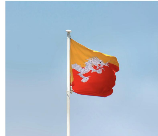
Bhutan National Flag

Toto Tours provides you access to one of the world’s most remote destinations and greatest vacation secrets.