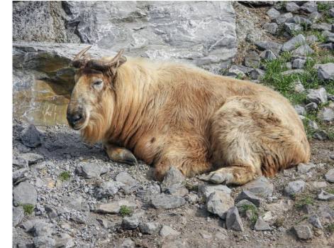
The Unusual Takin

After lunch, we visit the Royal Textile Academy, an exhibition hub of both ancient and modern textiles, and notable artifacts. The museum also displays Bhutan's rich tradition and vibrant culture of weaving and embroidery. Right next to the museum is the craft bazar. Small bamboo houses are lined up displaying interesting and unique locally made arts and crafts. You can explore stalls and even shop for some souvenirs. Then walk for about 15 minutes to the Produce Market, the largest vegetable market in the country. You can see the variety of food of the country, including basket upon basket of fiery chilies, fresh cheese, and fruits. This is perhaps a good opportunity for photography and to mingle with locals who come from the nearby villages to sell their farm products. Afterwards, you may either rest in the hotel or further explore Thimphu town. Overnight in Thimphu. (All Meals)