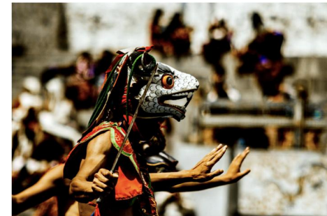
Farewell to Bhutan

Enjoy a leisurely breakfast this morning as our flight to Bangkok doesn't depart until 4:20pm. We leave the hotel before noon and stop for lunch on our way to the airport. Before checking in we bid a fond farewell to our guide and driver, who have been with us from the beginning of the tour. Our flight makes a brief stop in Dhaka before landing at 9:50pm in Bangkok. Tour services conclude upon arrival in Bangkok. We recommend that you stay at the airport Novotel in Bangkok tonight and book your homebound flight no sooner than the morning of November 25, 2024. (Breakfast / Lunch)