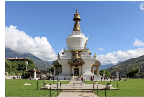
National Memorial Chorten in Thimphu

After breakfast we commence a scenic drive to Thimphu via Dochu La pass at about 10,000 ft. elevation, where on a clear day we can enjoy spectacular views of the Himalayas. Along the way we stop at Metsina and hike through rice paddies up to the Chimi Lhakhang Temple. This temple is dedicated to the great Yogi of the 14th century known as Drukpa Kuenley, or the "Divine Madman," who is believed to have blessed women who sought fertility with a large phallus. In the temple we see paintings, images and symbols having been used to depict the teachings of Buddhism for centuries. After visiting the temple, continue driving to Dochu La Pass. From the pass, drive downhill through the forests of rhododendron, fir, and hemlock all the way to Thimphu. We visit the National Memorial Chorten, which is the most beautiful stupa, and then check in at our hotel. Enjoy free time to explore Thimphu independently. Overnight in Thimphu. (All Meals)