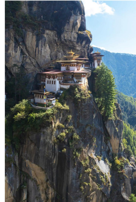
Tiger's Nest Monastery

The 8th century Spiritual Master Padmasambhava (popularly known as Guru Rinpoche in Bhutan) is said to have flown on the back of a tigress to meditate in a cave where Taktsang Monastery now stands. With unique architecture and breathtaking views, the monastery has several shrines, temples, and meditation caves. After exploring the monastery, hike back to the halfway point where we enjoy lunch at the cafeteria. After lunch we continue walking down to the valley floor where our vehicle is waiting to transfer us back to Paro. On the way to our hotel, we explore Paro town, which is marked by lovely traditional houses, interesting souvenir shops and modern style cafes. Toto Tours hosts a Farewell Dinner tonight celebrating the successful conclusion of our Bhutan adventure. Overnight in Paro. (All Meals)