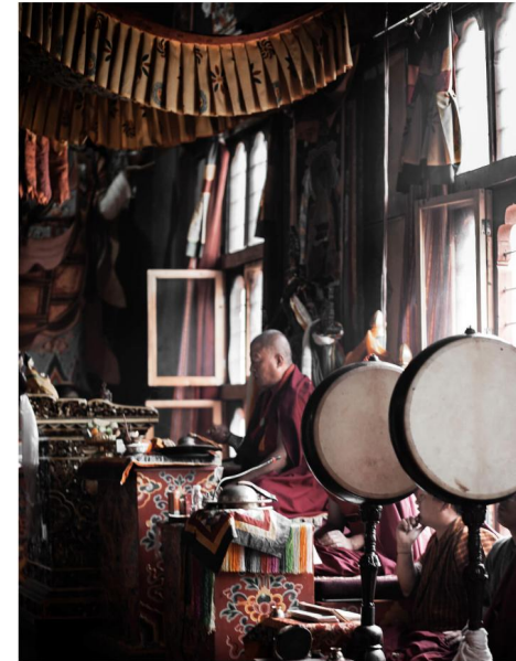
Learn About Buddhism and Interact with Monks

We take a break for lunch, and then visit the Thangthong Dewachen Nunnery built in 1976 by Thangthong Gyelpo. He was not only a spiritual master, but also a builder of chain bridges. About 70-80 nuns live in this peaceful place where you can light butter lamps and offer few prayers. We conclude our sightseeing with a visit to the Tashichho Dzong, the seat of the combined religious and secular government – a unique feature of Bhutanese civil society where the King and the High Llama theoretically hold equal power. Overnight in Thimphu. (All Meals)