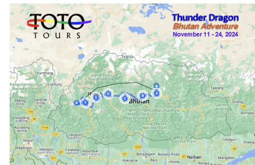
Bhutan Map - Click to open in Google Maps