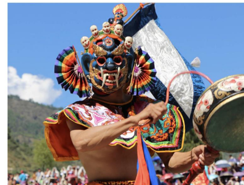
Festival Mask Dancer

In the late afternoon, take a 2-hour drive to Trongsa, the ancestral home of the royal family. The journey takes you through Yutong La Pass at 11,155 ft elevation. From the pass, travel on winding roads that descend through a breathtaking forest adorned with pine and vibrant rhododendron trees. Our drive concludes at our hotel for our overnight in Trongsa. (All Meals)