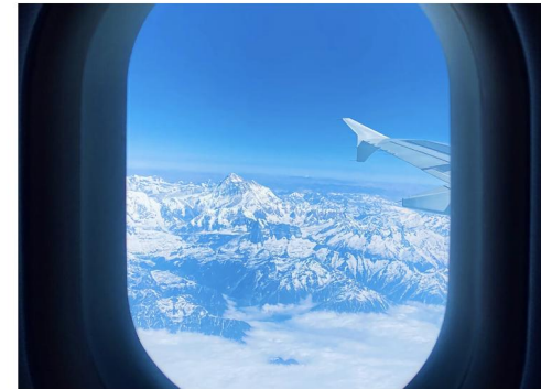
Mountain Views Flying to Bhutan

Paro International Airport is one of the most thrilling airports due to its lofty Himalayan location. As the flight approaches Paro, you are treated to the awe-inspiring sight of Mount Jumolhari and Jichu Drake. Descending into the tranquil Paro Valley, you are greeted by verdant alpine forests, charming monasteries, temples, and traditional farmhouses. Our representative greets you at the airport and we commence our sightseeing since it is too early for hotel check-in.