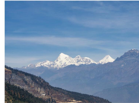
Mt. Jomolhari as seen from Chele La Pass

Today we begin an exciting drive to Paro with a stop at Chele La Pass. From the pass we hike along the ridges, each higher than the last. If the weather is clear, you can see stunning views of Mount Jomolhari and Jichu Drake. If you are up for an adventure, you can hike further to the last ridge, Kungkarpo, at 13,780 ft elevation. This spot is used for sky burials. At Kungkarpo we are greeted by awesome views of Tiger Mountain in one direction, and in the other, Mount Kanchenjunga in Sikkim--the world's third highest mountain. Take a well-deserved rest while enjoying the spectacular views of the Himalayas from this vantage point. We hike back to our vehicle and drive to our Paro hotel. The remainder of the day is free to rest at the hotel or explore Paro town, including Kaja Throm, the vegetable market. Overnight in Paro. (All Meals)