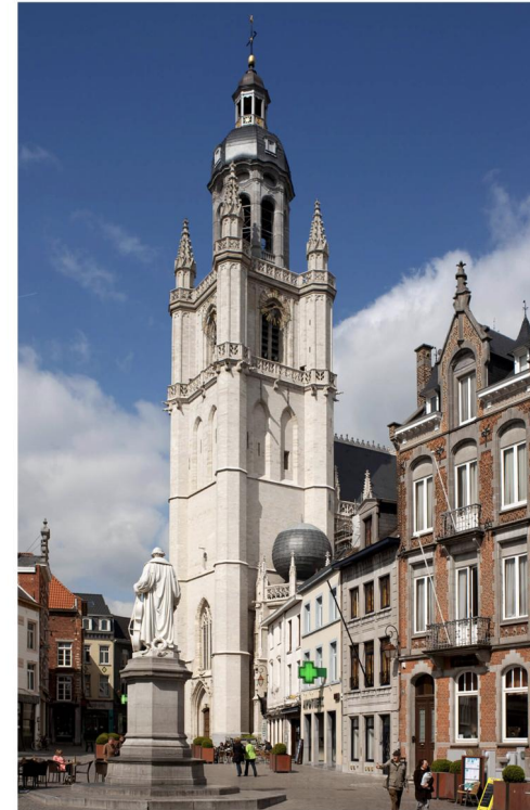
Halle Market Square

Afternoon sailing on the Canal du Centre to Strepy-Thieu where we dock for the night. (All meals)