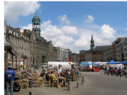
Mons Town Hall