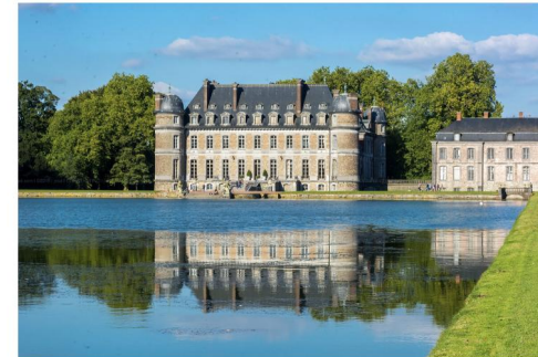
Château de Beloeil

After reboarding our barge in Mons, we spend the afternoon cruising on the Nimy-Blaton-Péronnes Canal, a strategic waterway in the center of Belgium. The canal opened in October 1955 and enabled a liaison between the Canal du Centre and the Scheldt River. We dock in Péronnes-lez-Antoing where we are free to do some personal exploration before dinner and overnight. (All meals)