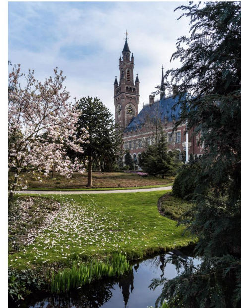
The Peace Palace

We conclude our journey with a one-hour drive to Amsterdam, where we check in at our centrally located hotel. After some time to settle in, we take a short walk to d'Vijff Vlieghen to enjoy a special three-course dinner with wine. (Breakfast / Dinner)