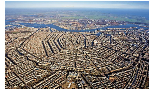
Farewell to Amsterdam

The tour extension concludes with your check-out from our hotel this morning. We have not included airport transfers since we are not all departing on the same flight. It is easy to organize a taxi transfer with the hotel's concierge. Please let us know if you wish to extend your stay an additional night at our Amsterdam hotel. Our rate is only valid for one additional night.