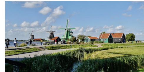
Zaanse Schans Windmills

After an exciting day in the countryside, we return to Amsterdam for our festive Farewell Dinner with wine included. (Breakfast / Dinner)