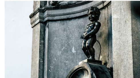
Arrive in Brussels

Plan your international flights to arrive in Brussels by mid-afternoon today. It is easy to catch a taxi from the airport to our hotel, or book a private transfer (we'll provide some options prior to departure). Explore the amenities of the hotel and the surrounding neighborhood until time for our welcome cocktail in the hotel's bar. Afterwards we walk to a nearby restaurant for our Welcome Dinner. Please let us know on your reservation form if you would like to arrive one day early (July 1) to rest up from jet lag. (Welcome Dinner included)