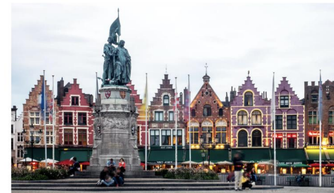
Farewell to Belgium

Enjoy breakfast on board this morning before disembarking at 9:00am. We will assist those who are not joining our tour extension to the Netherlands in coordinating a departure transfer to the Brussels airport or destination of your choosing. It is approximately a one-hour drive to the airport. There are bus and train options, as well as taxi and ride-share. Bon Voyage and safe travels! (Breakfast)