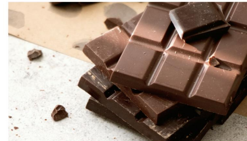
Brussels Chocolate Factory

Finally, we transfer to the pier at Halle (approximately 1 hour drive) and board our barge at 6pm. After settling into our cabins we are introduced to the crew during a welcome cocktail reception, followed by dinner and our first of six nights aboard. (All meals)