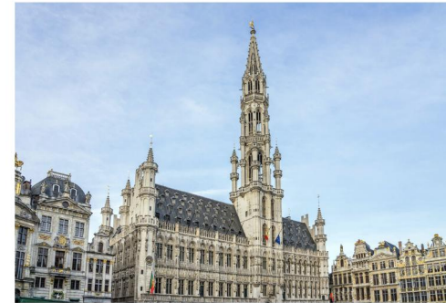
Brussels Grand Place

After lunch we participate in a Chocolate Workshop. After being welcomed to the chocolate factory we learn the history of cocoa and how it is transformed into chocolate. We have a demonstration of how artisanal pralines are created by professional chocolate-makers assisted by two of our group members. Interspersed throughout the various presentations are three different chocolate-tastings. To conclude, the staff takes questions and we have an opportunity to purchase these fabulous chocolates in the gift shop.