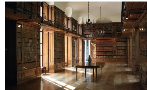
Château de Beloeil Library