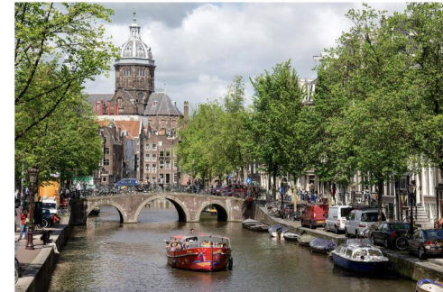
Amsterdam Canal Tour