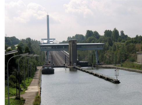
Ronquières Inclined Plane

We continue cruising to Mons where we embark on a food tour . Few cities can boast about their heritage like Mons can. This is a vibrant, modern city with a deep, historic past. The Grand-Place offers a myriad of places in which to lose yourself. Our guide takes us to the center of Mons to learn about the city's history and edible delights. This stroll is a combination of history, culture, and anecdotes accented by a tasting of four local specialties. Indulging in the local cuisine makes this tour an unforgettable experience. After the tour we return to our barge for dinner and overnight in Mons. (All meals)