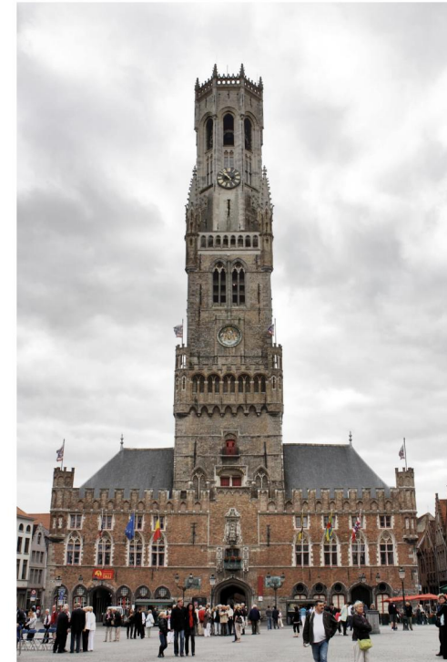
Bruges Belfry (UNESCO)

We return to our lovely barge for one final night aboard. Tonight is our festive gala evening where we thank the crew and wish them a fond farewell. (All meals)