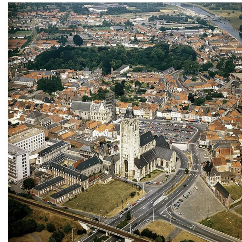
Aerial View of Oudenaarde

We then head over to a distillery. This will be the time to learn about how jenever, gin, and whiskey are distilled. Of course, we'll have a taste! Return on board our barge for dinner and overnight. (All meals)