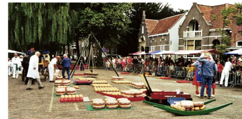
Edam Cheese Market