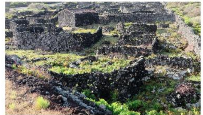
Pico Island Vineyard