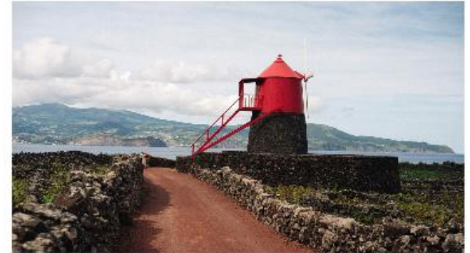
Pico Island Windmill

After breakfast, we transfer to Horta Harbor for our ferry trip over to Pico Island (30 minutes). We arrive at Madalena harbor and drive by coach to Cabeço do Cão and various villages. We visit the volcanic rock formations at Cachorro and then continue to Sao Roque to visit the old whale industrial factory. Taking the mountain road from Cais do Pico, we cross the island through a mountain road up to an altitude of 3,000 feet, where we see endemic vegetation. We stop at Lagoa do Capitão to visit the Whale Museum, followed by lunch at a local restaurant. We drive along the island's south coast to see the unique landscape full of vineyards and the volcanic rock walls that earned this area a UNESCO World Heritage Site designation. We will make time to take a short walk between the vineyards and then visit the Wine Museum. Returning to Madalena harbor, we take the ferry back to Faial Island for a free evening at our hotel. (Breakfast / Lunch)