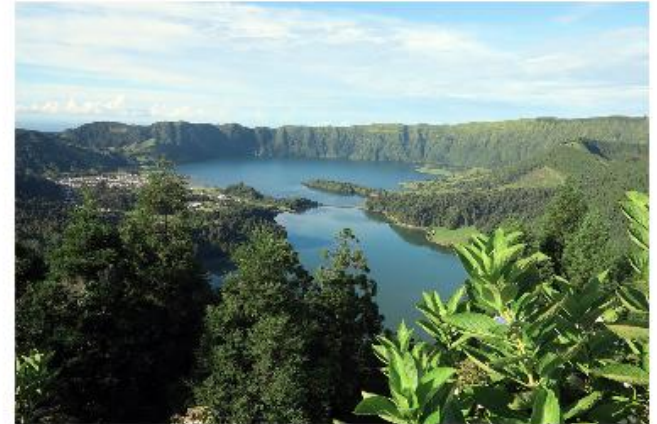
Sete Cidades Tour

After breakfast, we depart from the hotel at 9:00 am taking the mountain road towards the twin lakes. We stop at "Vista do Rei" a viewpoint where we can take in the remarkable scenery. Descending to Sete Cidades on the crater floor, we enjoy a leisurely walk along the shore of the blue lake or just take a coffee break. Continue along the south-west coast to "Miradouro do Escalvado" with a superb view of the fishing village of Mosteiros. Descend to the village of Mosteiros where you will witness the remarkable lava formations at the ocean coastline, beautiful summer homes, beaches and natural pools. The return to Ponta Delgada will be along the south coast through various parishes, concluding the day with a visit to one of the local pineapple plantations, and sampling their Pineapple Liqueur. Lunch at a local restaurant. The late afternoon and evening are free. (Breakfast / Lunch)