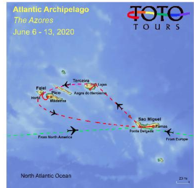
Tour Map - Click to Enlarge

Plan your international flight to arrive at Ponta Delgada airport (search for flights using the code PDL), most likely in the early morning. A driver will meet you at the airport terminal after you have collected your luggage and transfer you to Hotel Marina Atlântico. Due to early flight arrivals, we have guaranteed early check-in and included breakfast in the hotel restaurant. The rest of the day is at your leisure to explore the town of Ponta Delgada on your own. Early this evening, our group will gather in the hotel bar for cocktail hour, followed by a Welcome Dinner at the hotel. Overnight in Ponta Delgada. (Breakfast / Dinner included)