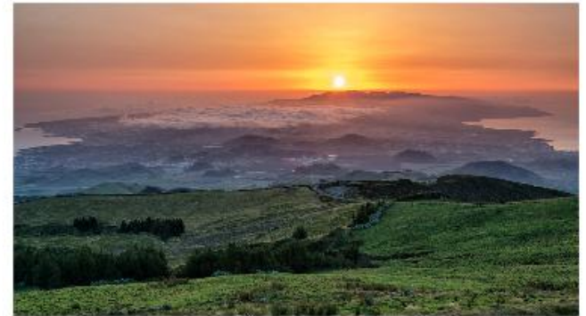
Farewell to the Azores

The tour officially ends after breakfast this morning. We provide your transfer to the Ponta Delgada airport in time to catch your flight back home. If you wish to extend your stay São Miguel Island, please let us know on your reservation form so that we can keep your room available for another night. (Breakfast)