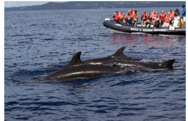
Whale and Dolphin Watching

After breakfast, transfer to the Horta Airport for our flight back to São Miguel Island. Our transfer to Furnas and check in at the Hotel Terra Nostra Garden, followed by lunch at a local restaurant. In the afternoon, we drive to Vila Franca do Campo where we embark on a 3-hour Whale and Dolphin watching tour. At the end of the activity, we return to our hotel for a free evening. (Breakfast / Lunch)