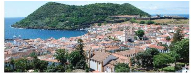
Angra do Heroísmo