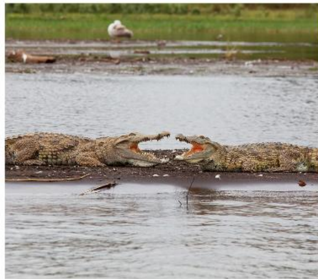
Nile Crocodile - Lake Chamo

In the morning, take a remarkable boat ride on the southernmost Rift Valley lake of Ethiopia, Lake Chamo. One can spot many hippos and giant crocodiles, and the scenery is truly unforgettable. Fishing for Nile perch and many other species by locals on their traditional boat is by far the best in the country. We can also watch various lowland water birds like the African Fish Eagle, Great White Pelicans, and egrets. Leaving Lake Chamo behind, we visit the Konso village where we enjoy lunch. The cultural landscape of Konso is a UNESCO World Heritage site, and is comprised of stone-walled terraces and fortified settlements in the highlands stretching back 21 generations (more than 400 years). Konso is known for its religious traditions, waga sculptures and nearby fossil beds. (All Meals)