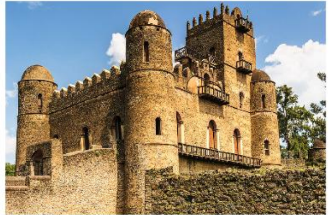
Fasil Ghebbi, Castle of Gondar

A full day of Gondar culture and history await you! Recognized as a UNESCO World Heritage site in 1979, the Fasilidas Palace stands in a compound filled with juniper and wild olive trees. The compound includes the Enqulal Gemb, or Egg Castle, named after its domed roof, the royal archive, many impressive churches and monasteries and a stable. These exemplify architecture that is marked by both Hindu and Arab influences, subsequently transformed by the Baroque style that the Jesuit missionaries brought to Gondar. This delightful mix has earned the city the nickname "The African Camelot". All Meals