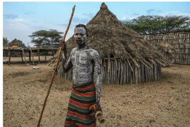
Karo Man

Enjoy a morning of leisure, or further tribal explorations before your transfer to the airport for our mid-day flight back to Addis Ababa. Upon arrival, our group returns to the Sheraton Hotel, where we spent our first night, and we check-in to our rooms. As today is merely a transit stop between two locations on our tour, the rest of the day is at leisure to rest up, go swimming in the pool, do some more exploring on your own, and enjoy fine dining at our hotel's restaurant. (Breakfast)