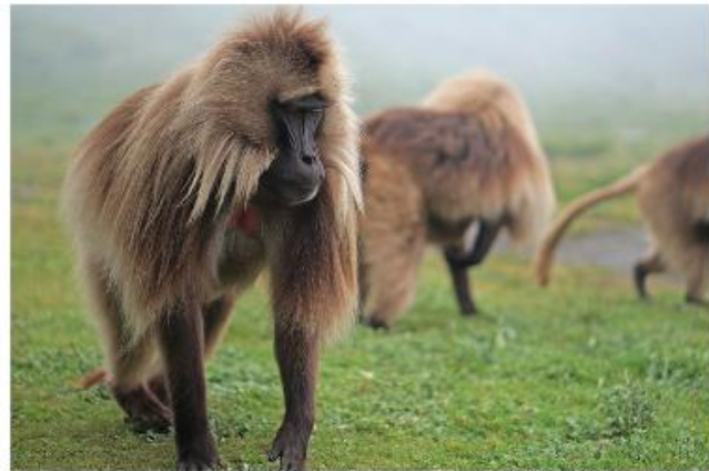
Male Gelada Baboons