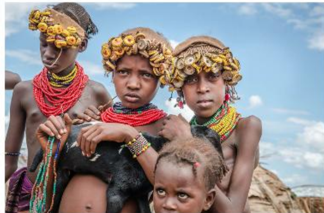
Dassaneck Tribe

This morning travel closer to the Kenyan border to visit the people of the Dessanech tribe. We cross the Omo River, one of the major rivers of the country that drains into Lake Turkana of Kenya, to visit one of the villages of the Dessanech tribe (meaning "people of the delta), who are the southernmost people of the country and are known for their scarifications. Over time the tribe absorbed a wide range of different people and it is now divided into eight main clans. Each clan has its own identity and customs, its own responsibilities towards the rest of the tribe and is linked to a particular territory. Continue with our drive to Jinka, the biggest town in the Omo region and our base to visit Mago National Park in whose lands reside the Mursi, perhaps the most famous of all the peoples of Southern Ethiopia. (All Meals)