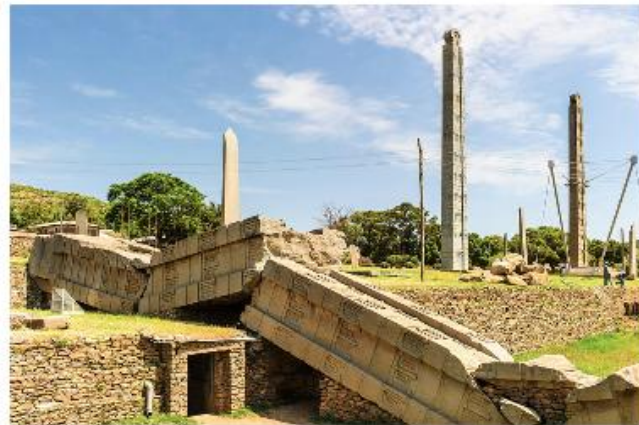
Ruins of Aksum (Axum)

After breakfast, we check out and take a morning flight from Lalibela to Axum, a town littered with the ruins of palaces, underground tombs, mysterious monolithic stelae carved from single pieces of granite, and many other historical relics. The founding of the Empire of Axum in the 5th century BC is often taken as the starting point of the Ethiopian civilization. This is also the place where one of the most important churches and pilgrimage sites in all of Ethiopia is located, where the Ark of the Covenant is reputed to be located. In the afternoon visit the most amazing sites of Axum, including its collection of ancient stelae, the bath and the palace of the Queen of Sheba, the museum, St Mary of TSION Church (Ark of the Covenant site), the tombs of former emperors King Kaleb and Guebre Meskel, and the chapel (only men are allowed to enter). Overnight in Axum. (All Meals)