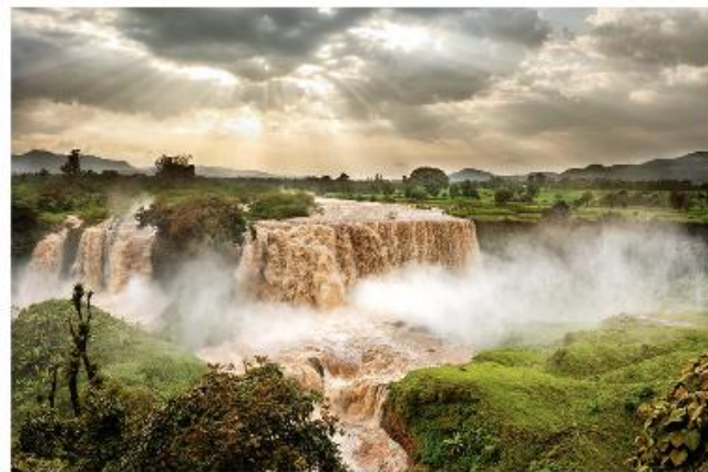
Blue Nile Falls

twenty miles downstream from Lake Tana, where a rumble of sound fills the air and the green fields and low hills tremble as the falls plunge 150 fifty feet down a sheer gorge throwing up a continuous mist that drenches the countryside up to a kilometer away. In turn, this deluge produces rainbows that shimmer across the gorge under the changing arc of the sun and a perennial rainforest. The pillar of cloud in the sky above, seen from afar, explains the local name for the falls, "Tissisat" or water that smokes. It takes about one hour to walk to reach the Falls and another hour to return. We check in at our hotel and the evening is at leisure. (All Meals)