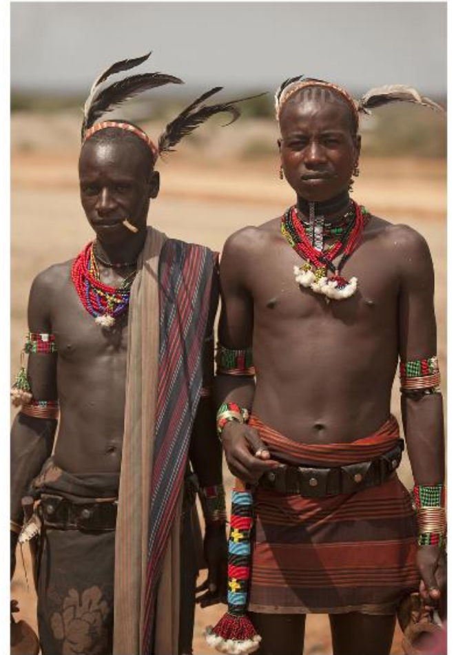
Hamar Warriors in Omo Valley

Friday, November 1, 2019 whose women are known for their striking appearance, adorned with ochre-colored hair hanging in a heavy fringe, leather skirts decorated with cowries, and many copper bracelets fixed tightly around their arms. The men are noted for the initiation ceremony of jumping over bulls. (All Meals)