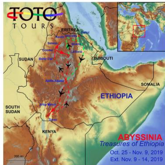
Tour Map - Click to Enlarge

Continue to St. George's Cathedral, dedicated to the national saint of Ethiopia. The museum houses a wide collection of important religious paintings, crosses of many designs, historic books and parchments, and beautiful handicrafts. There are also fine examples of modern paintings by the famous Ethiopian artist Afeverke Tekle. Last stop of the day is at the Zoological National History Museum at Addis Ababa University (AAU) which displays specimens of the wildlife attractions of Ethiopia. Enjoy a welcome dinner tonight and get your first taste of Ethiopian cuisine. (Dinner included)