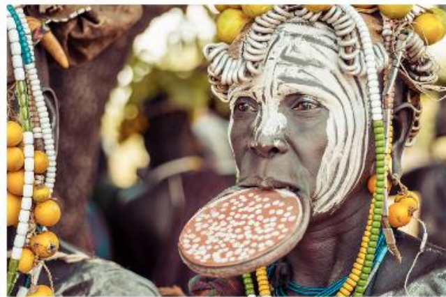
Mursi Woman

In the afternoon visit the Ari people, the biggest group in the Omo region, numbering over 100,000. Ari are living in wider villages with private compounds on which they have their huts and grow a variety of crops. They have large livestock herds and produce large quantities of honey. Ari women are famous for their pottery which they sell to support their families. (All Meals)