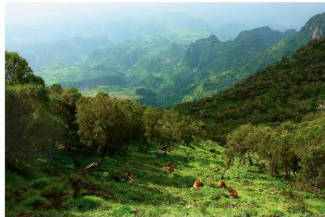
Landscape of Siemen Mountains

This morning we drive to Gondar, an important town for over two centuries, and a thriving center of religion, art and culture. Arrive in Gondar just in time for lunch. Afterwards, drive to the Simien Mountains, a stunning mountain range, alive with exotic plant and animal life. The highest mountain here, Ras Dashen at 14,905 feet above sea level, proudly carries the local moniker 'The Roof of Africa.' These spectacular segments of the Simien Mountains are considered the wildest and most beautiful sites of all Ethiopian landscapes and serve as home to many endemic animals like the highly endangered Ethiopian wolf, Waliya ibex, and Gelada baboons, and plants like the Giant Lobelia. The massive 13,000-foot-high table of rock offers easy but immensely rewarding trekking along the edge of a plateau that falls sheer to the plains far below. The scenery and the variety of wildlife will leave you speechless. We stay at a lodge sitting atop an escarpment with wonderful views of the mountains, and our second day here is dedicated to exploring in the mountains. (All Meals)