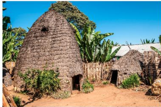
Dorze Tribe Huts