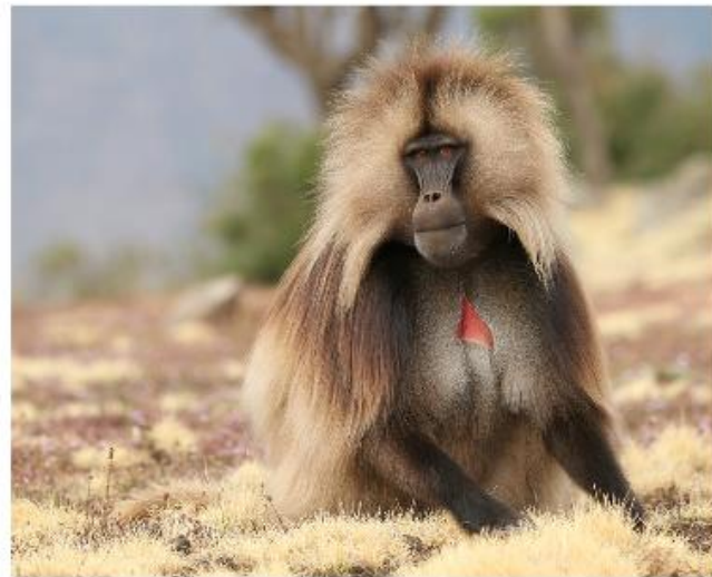
Male Gelada Baboon Bids Farewell

We drive back to Mekele Airport to catch our morning flight back to Addis Ababa. Upon arrival, you can enjoy the rest of the day relaxing or exploring the capital city. In the evening, enjoy a second farewell dinner with traditional Ethiopian food, music, and dance. After freshening up at the hotel, your tour of Ethiopia concludes with a drop-off at the airport for your flight home, arriving the next day. (All Meals)