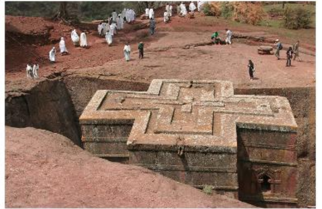
Lalibela Church of St George

These awe-inspiring, towering edifices were hewn out of the solid, red volcanic rock on which they stand. They seem to be of superhuman creation – in scale, in workmanship and in concept. Some lie almost completely hidden in deep trenches, while others stand in open quarried caves. A complex and bewildering labyrinth of tunnels and narrow passageways with offset crypts, grottoes and galleries connects them all – a cool, lichen- enshrouded, subterranean world, shaded and damp, silent but for the faint echoes of distant footfalls as priests and deacons go about their timeless business. We spend two exciting days exploring these architectural marvels. We also enjoy an opportunity to meet with the clergy and have a brief discussion about the history of the churches. We spend these two nights in a lodge centrally located among all the churches and other historical sites in the surrounding area. (All Meals)