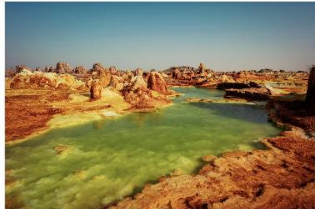
Dallol - Danakil Depression

We get an early start this morning for a three-hour drive to Dallol to enjoy the spectacular view of the small hills and colorful hot springs. These hot springs are composed of different minerals along with sulfurs and potash to create spectacular colors. Dallol volcano is located in the Danakil Depression in Northeast Ethiopia, in a remote area subject to some of the highest average temperatures on the planet. The sultry Danakil Desert surrounds the desiccated settlement, which contributes to Dallol's unforgivingly hot climate. The annual average high temperature is 105 °F. Heat and drought pummel Dallol, making visitors feel like they're on another planet. It is one of the most inhospitable regions of the world but is nonetheless spectacular. We drive back to Wukro for the night. (All Meals)